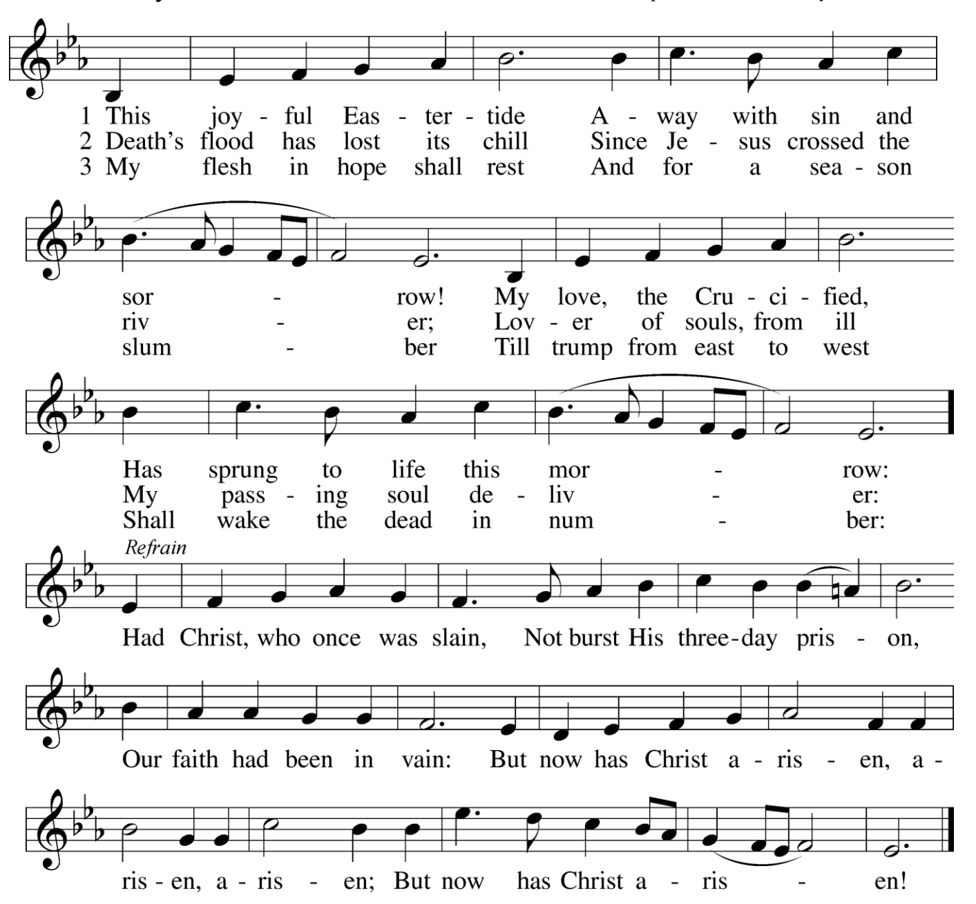
This Joyful Eastertide Lutheran Service Book 482, Lutheran Worship 140, The Lutheran Hymnal 2N/A08