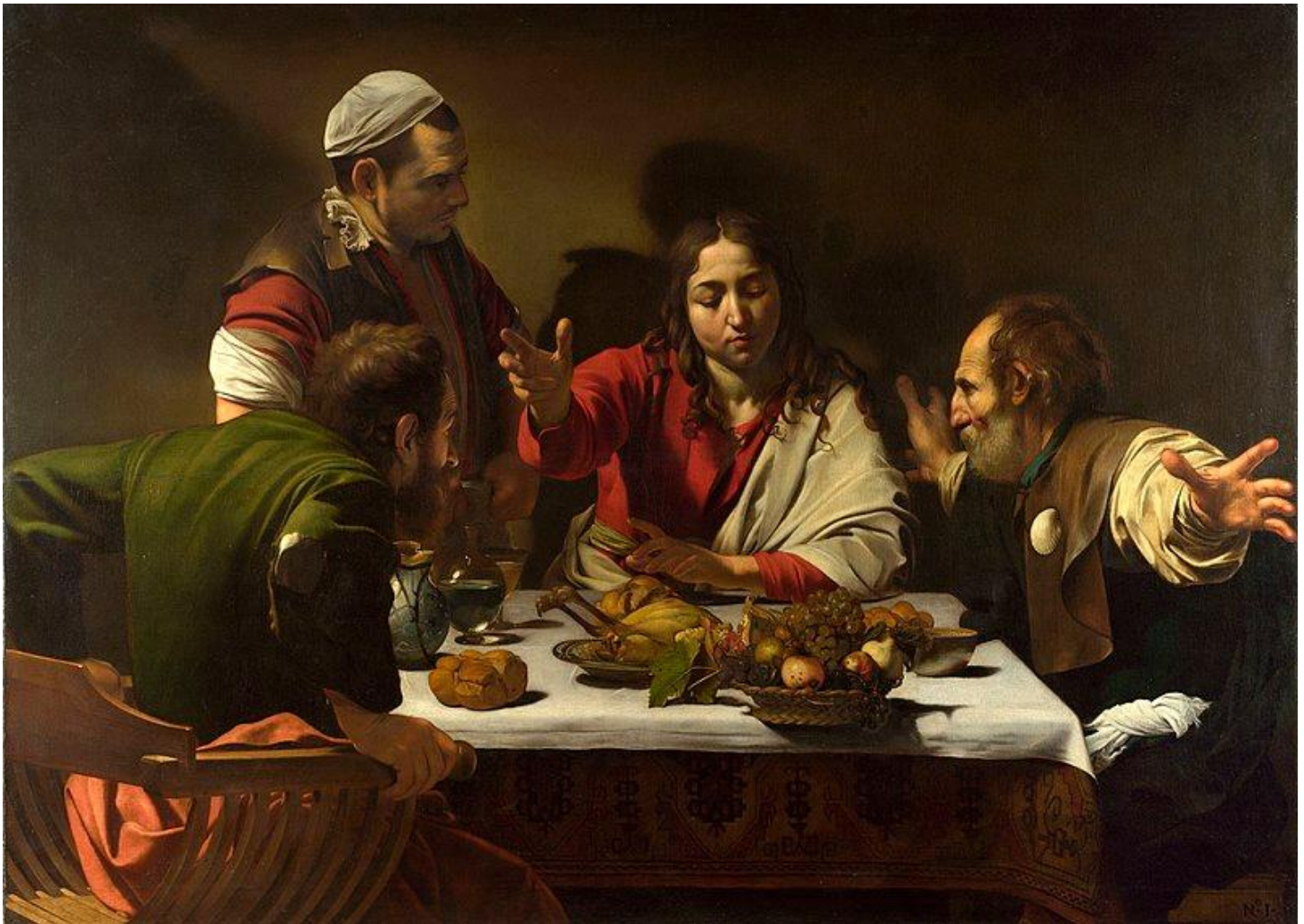
Supper at Emmaus by Caravaggio, 1601