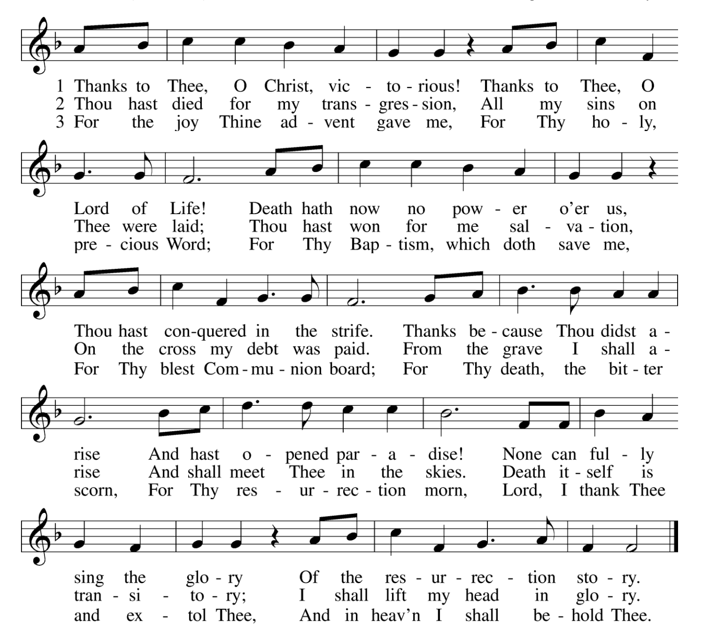
Thanks to Thee, O Christ, Victorious Lutheran Service Book 548, Lutheran Worship n/a, The Lutheran Hymnal 207