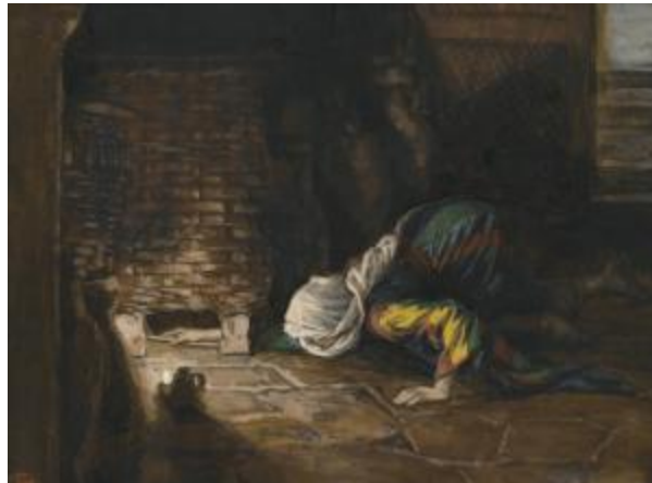
The Lost Drachma (La drachme perdue) James Tissot, c. 1890

saying, 'Rejoice with me, for I have found the coin that I had lost.' 10 Just so, I tell you, there is joy before the angels of God over one sinner who repents."